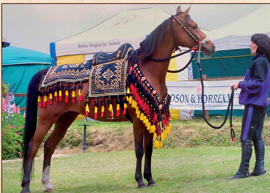
Hachim produced endurance mare Zaha (ex Zaharina by Ludomino)