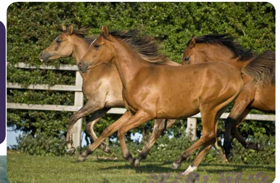
Below 6-year old Rhapsody in Blue, owned and bred by Gadebrook - 100% Crabbet by Shaded Silver x Summertime Blues by Indian Idyll