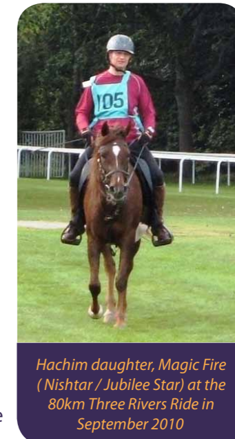
Hachim daughter, Magic Fire (Nishtar / Jubilee Star) at the 80km Three Rivers Ride in September 2010

Gadebrook foals are handled and socialised from birth and love meeting the dozens of visitors from all over the world who come to the stud every year for Open Days, Reunions and stud tours. For my part, I try to support my horses wherever they are competing in the world. I attend the WAHO conferences (Syria, Oman and Qatar), am on the Council of the