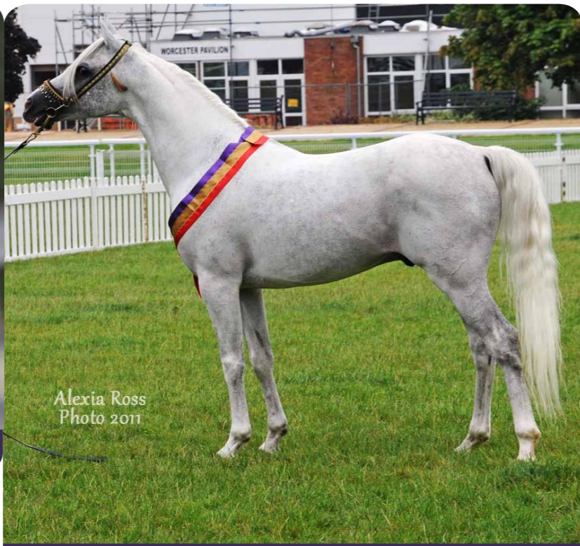
Alexia Ross Photo 2011