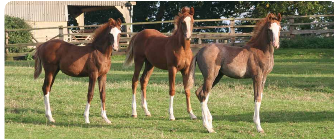
2006 - a good year for Crabbet filly foals at Gadebrook: from left: Brightstar (Bright Cavalier x Nishtar by Jubilee Star); Bright Dawn (Bright Cavalier x Zaharina by Ludomino) + Rose of Summer (Shaded Silver x Summertime Blues by Indian Idyll)