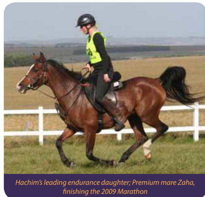
Hachim's leading endurance daughter; Premium mare Zaha, finishing the 2009 Marathon

Remington Steele , the 300-mile and Tevis Buckle-winning "Living Legend" and WAHO winner whom I