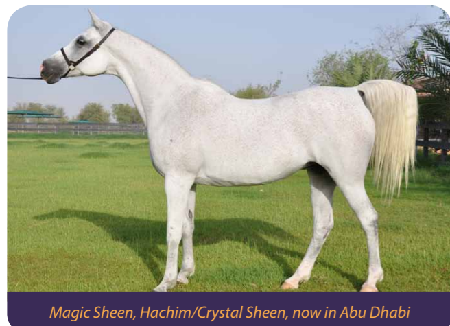
Magic Sheen, Hachim/Crystal Sheen, now in Abu Dhabi

Flashy Rusleema (Rusleem x Sunne in Silver) was snapped up by an Australian breeder near Perth and has given him a delightful filly.