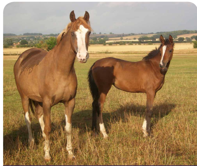
AHS Premium mare Jazmyn (Kasadi x Sophy) 93% Crabbet, with 2010 Sambist filly Mandarin

To the Bedouin, purity has been paramount. As breeders of hardy horses in an inhospitable climate, they kept only those proven lines with the attributes we admire today. How lucky we Crabbet breeders are that Wilfrid Scawen and Lady Anne Blunt searched so diligently and for so long throughout the Near East and Egypt to bring back some remarkable horses as the basis for their Arab stud. Along with many others, I still benefit from their lines today 🐾